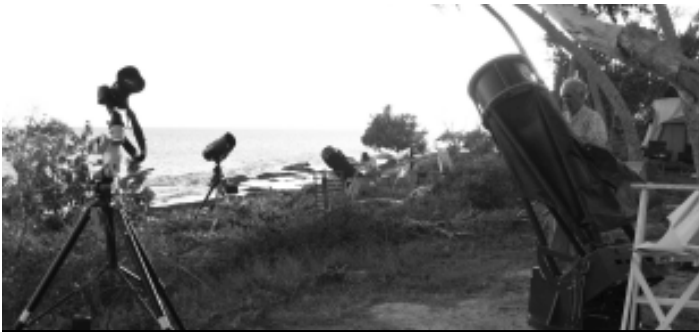
Ready for Tropical Winter Skies