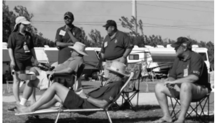
Busy SCAS volunteers at the WSP