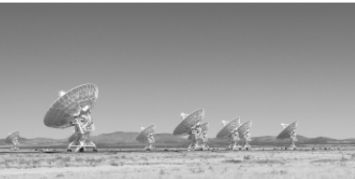
Gigantic VLA Radio Telescopes, Socorro, NM