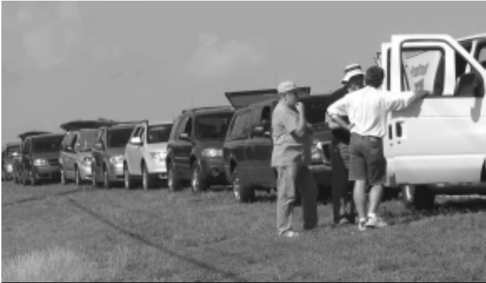
Welcome to Winter Star Party 08! (US 1 FL Keys)